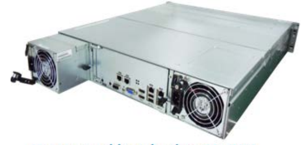
Hot-swappable redundant 80+ PSU