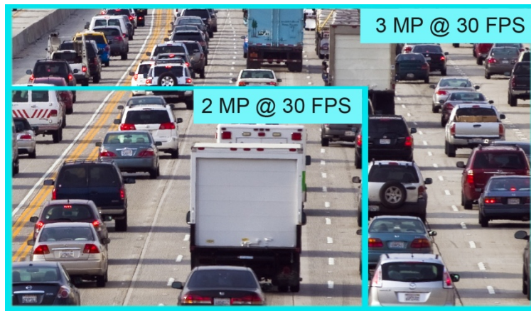
Figure 4 – Surveon 3M 30FPS Camera

With ROI technology, a Surveon 3M IP Camera uses only 2/3 bit rate of a 2 Megapixel IP Camera's but can see at least 1.5 times wider.