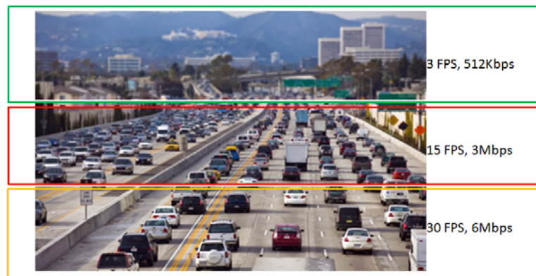
Figure 3 – Example of ROI Application

For a traffic monitoring project as below, the most important region is the pulling-in cars, and the least important one is the sky. Having set the priorities, we can now set the most important region (in the yellow bracket) with higher FPS and bit rate to have an excellent image quality, while the least important one (in the green bracket) with lower settings. This way bandwidth can be cut down and attentions can be narrowed down to the most important region.