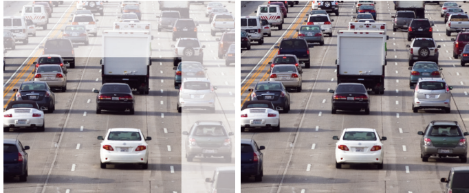
2 MP @ 30 FPS: 2 Lanes